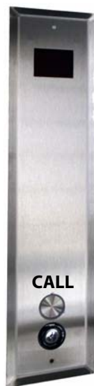
Figure 2 Keyed Hall Call

In the event of a building power failure, the door/gate system is provided with a temporary power back-up system to continue the opening operation for a number of times. On resuming normal building power, the back-up system will turn OFF and begin automatically recharging.