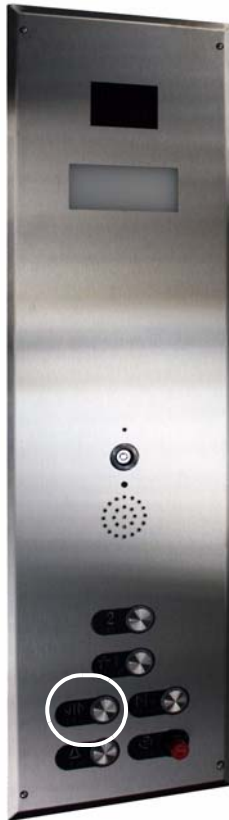
Figure 3 Door Open Button

When the elevator is at a landing level, the Two-Speed Horizontal Sliding Doors or Automatic Pro-Door can be opened by pressing the Door Open button. Normally the doors will have opened and already closed automatically. The Door Open button allows the door to be reopened.