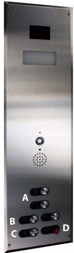
Figure 1 Keypad COP

A single handrail is mounted to the Cab Operating Panel (COP) side of the cab below the COP.